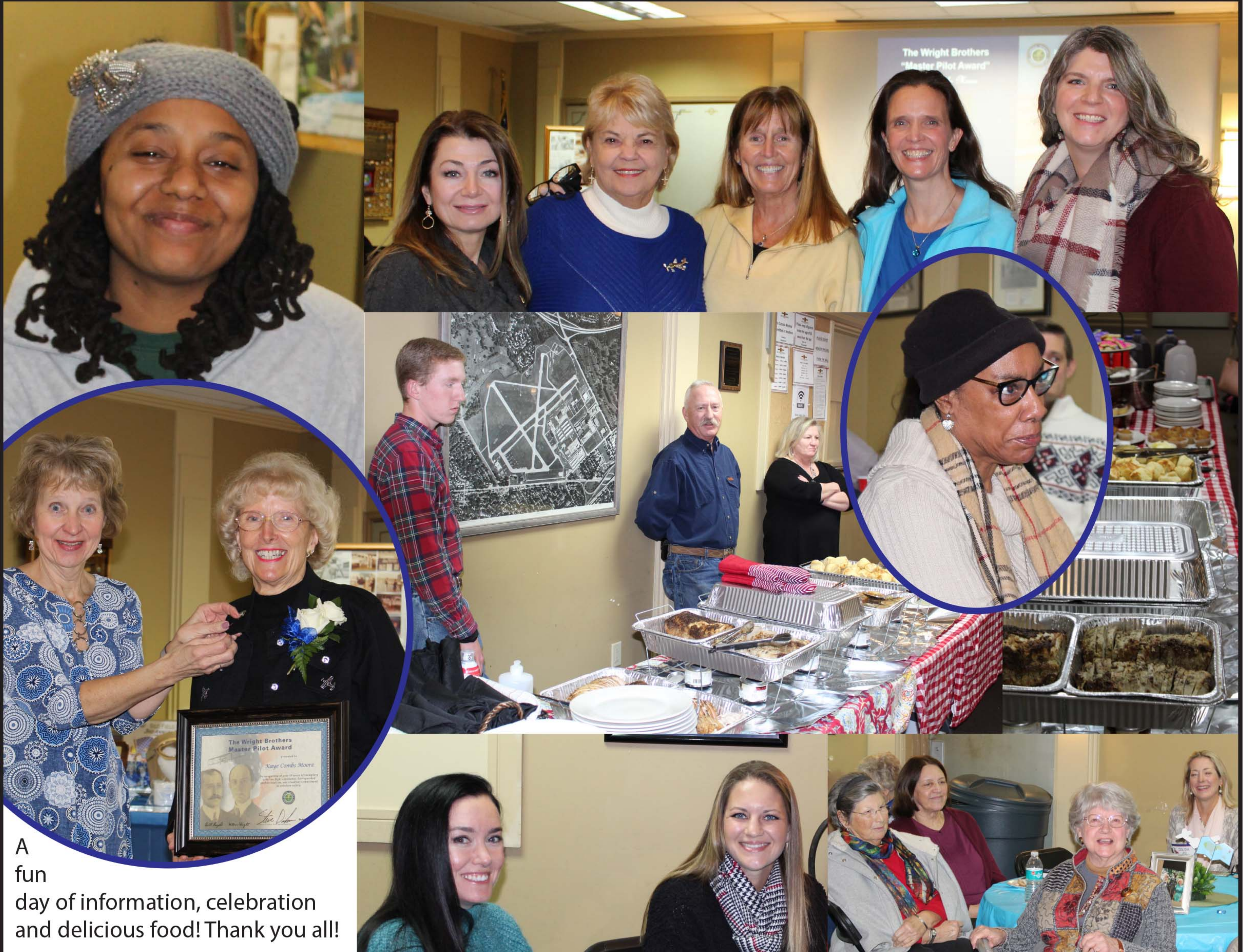
A fun day of information, celebration and delicious food! Thank you all!