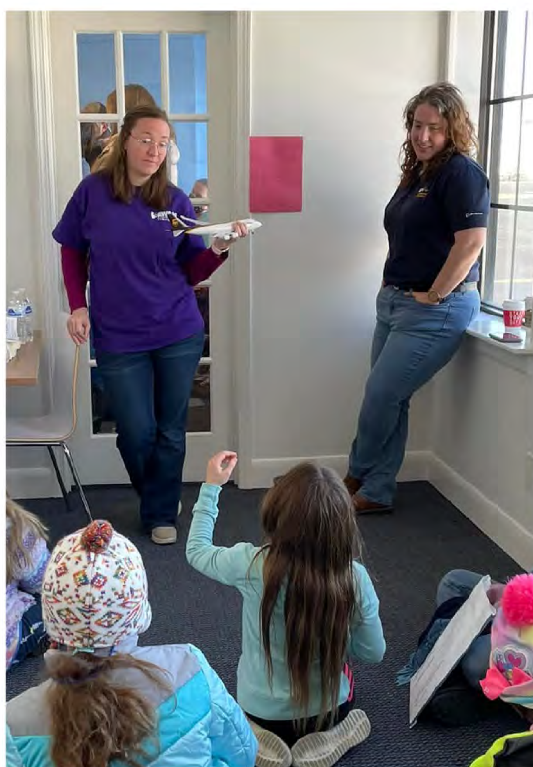
UPS engineers shared dozens of aviation career possibilities.