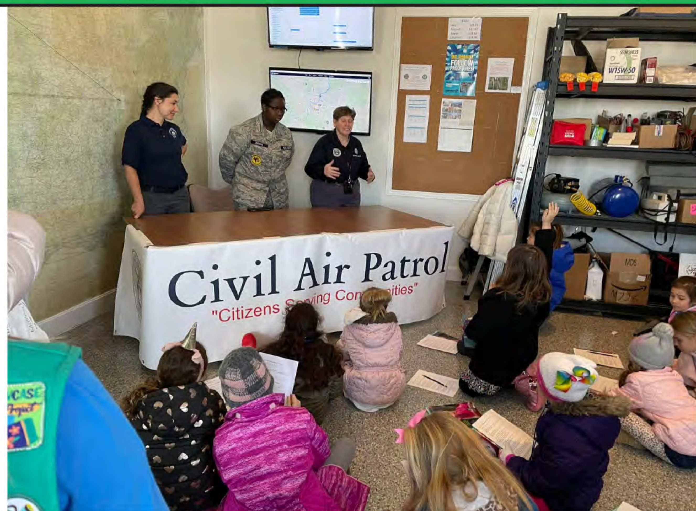
Civil Air Patrol leaders and cadet.